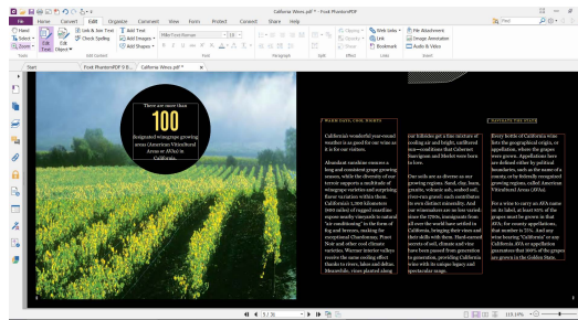
Edit content and layout like a word processor